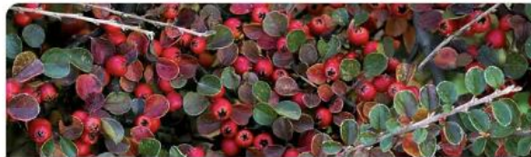
COT-HOR Cotoneaster horizontalis

An evergreen to semi-evergreen shrub with gray-green leaves, pinkish-white flowers, and orange-red berries. Attractive to bees and pollinators.