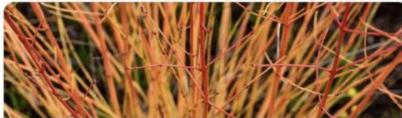
COR-MWF Cornus 'Midwinter Fire'

Offers distinctive pink to red bracts in early summer, resembling flowers. The foliage turns red and purple in autumn.