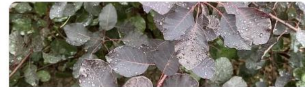
COTI-SJO Cotinus coggygia 'Smokey Joe Purple'

Known for its herringbone pattern of branches, this deciduous shrub produces small pink flowers followed by bright red berries.