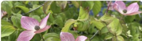
COR-KMS Cornus kousa 'Miss Satomi'

Offers distinctive pink to red bracts in early summer, resembling flowers. The foliage turns red and purple in autumn.