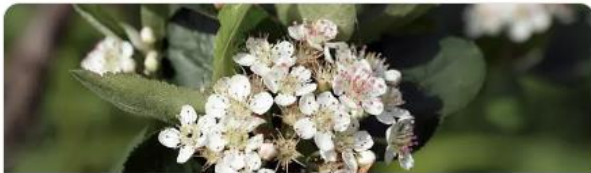
COT-FRA Cotoneaster franchetii

A low-growing, evergreen ground cover with small, glossy leaves, white flowers in spring, followed by red berries in autumn.