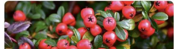
COT-DAM Cotoneaster dammeri

Notable for its fiery orange to red stems in winter. It has green leaves in summer, which turn to yellow-orange in fall.